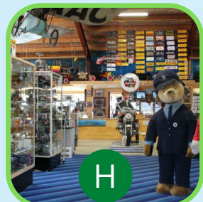
Toy and Transport Museum Wanaka