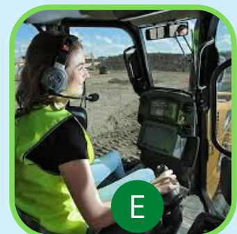
Dig It Invercargill