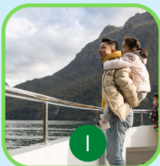
Cruise Milford Sound