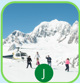
Snow Landing Franz Josef Glacier