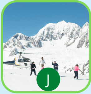
Snow Landing Franz Josef Glacier