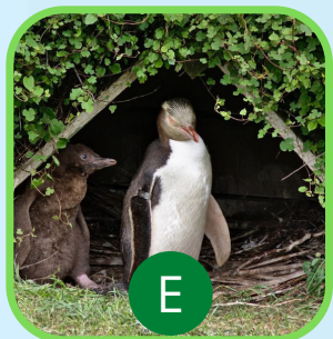
Penguin Place Dunedin