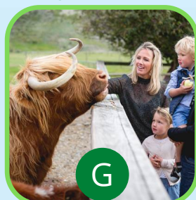
Walter Peak Queenstown