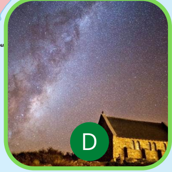
Star Gazing Tekapo