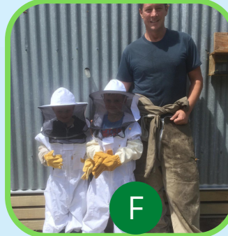
Bee Keeping Queenstown