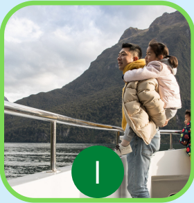
Cruise Milford Sound