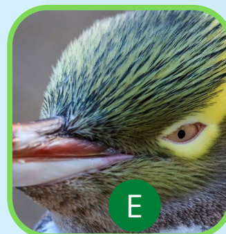
Wildlife Cruise Dunedin