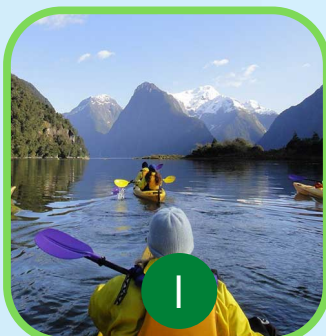
Sea Kayaks Milford Sound