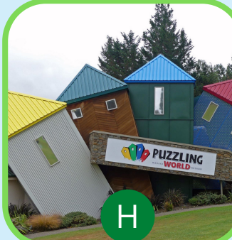
Puzzling World Wanaka