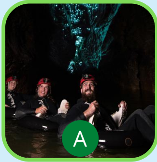
Black water tubing Greymouth