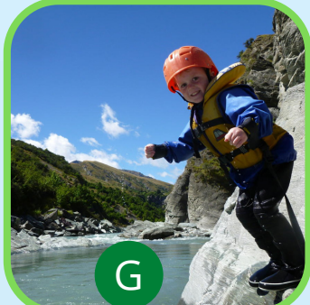
Family Adventure Rafting Queenstown