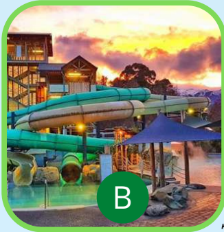
Thermal Pools Hanmar Springs