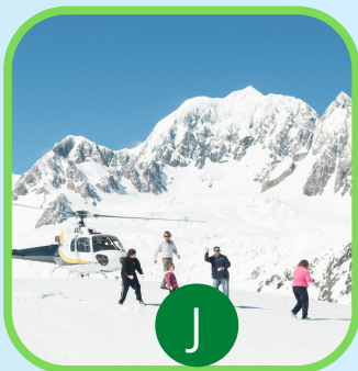
Snow Landing Franz Josef Glacier