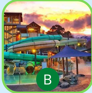
Thermal Pools Hanmar Springs