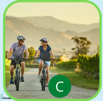
Bike the Winery's Marlborough