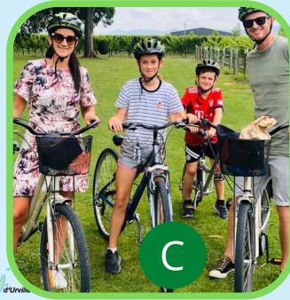
Bike the Winery's Marlborough