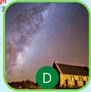
Star Gazing Tekapo