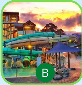
Thermal Pools Hanmar Springs