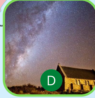
Star Gazing Tekapo